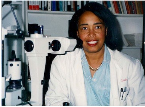
Dr. Patricia Bath (1942 – 2019)